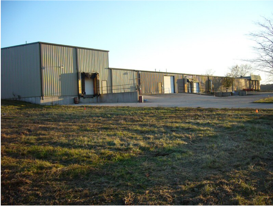
View from Capital Drive (North)