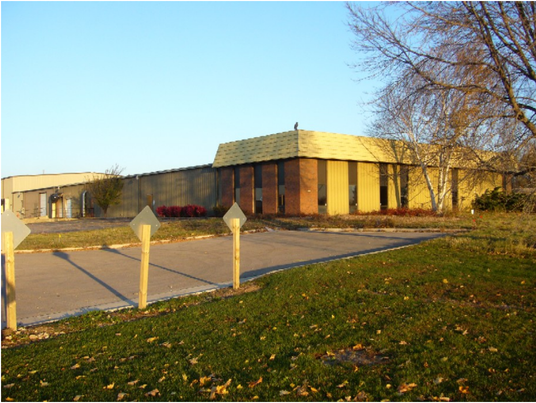
View from Reiner Rd