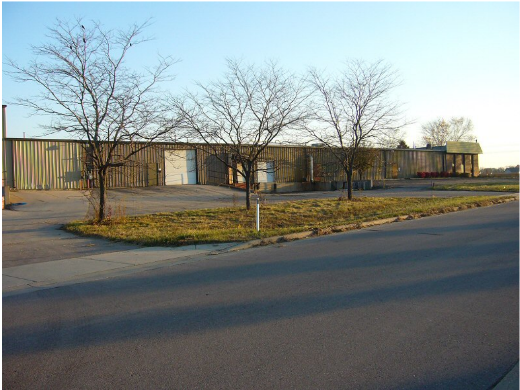
View from Capital Drive (West)