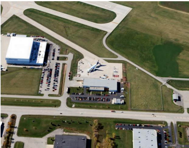
Federal Express Ramp

This report has identified and quantified the economic contribution of Outagamie County Regional Airport's 2008 activity levels to both Outagamie County and the State of Wisconsin.