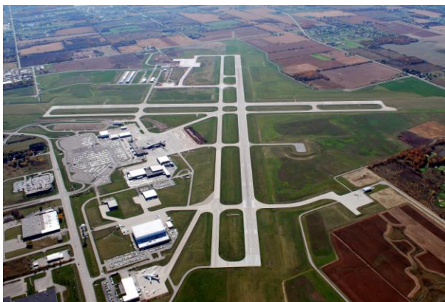
Outagamie County Regional Airport

A study by the Wisconsin Department of Transportation (WisDOT) shows that between 1997 and 2001, over 85 percent of new or expanded manufacturing businesses were located within 15 miles of an airport capable of handling jet aircraft. These manufacturers provided 34,064 jobs for Wisconsin residents.