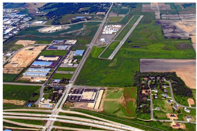
Middleton Municipal-Morey Field