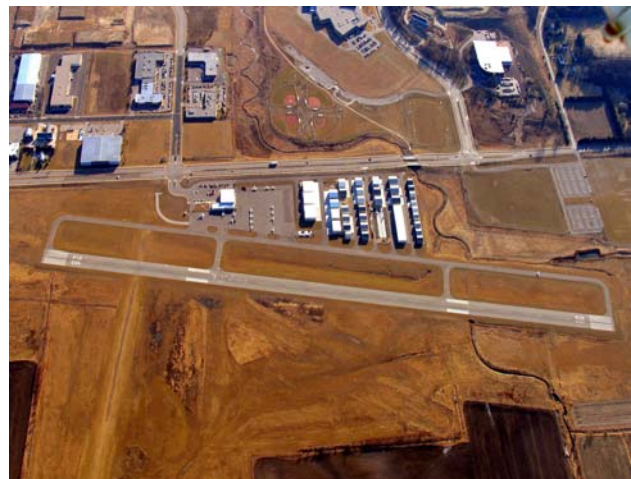
Middleton Municipal–Morey Field

The economic contribution of Middleton Municipal–Morey Field is comprised of three types of impacts: Direct Impact of the Airport, Direct Impact of Airport Users, and the Multiplier Impact. Each of these effects is expressed in terms of their effect on economic output (sales), employment (jobs) and wage income.