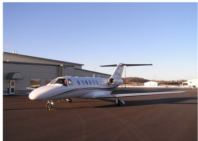
Middleton Municipal-Morey Field

Middleton Municipal-Morey Field has one paved runway and one turf runway. The primary runway (10/28) is 4,000 feet long by 100 feet wide. Lighting aids on this runway include Medium Intensity Runway Lights (MIRLs), Precision Approach Path Indicators (PAPI), and Runway End Identifier Lights (REILs). The secondary runway (01/19) is turf, 2,000 feet long and 120 feet wide.