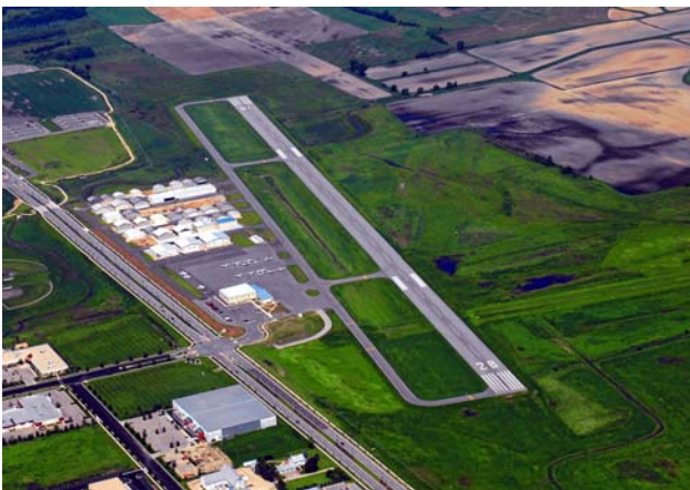
Middleton Municipal–Morey Field

Communities that are readily accessible by air transportation are at a competitive advantage and may realize economic and quality of life benefits that can affect every citizen.