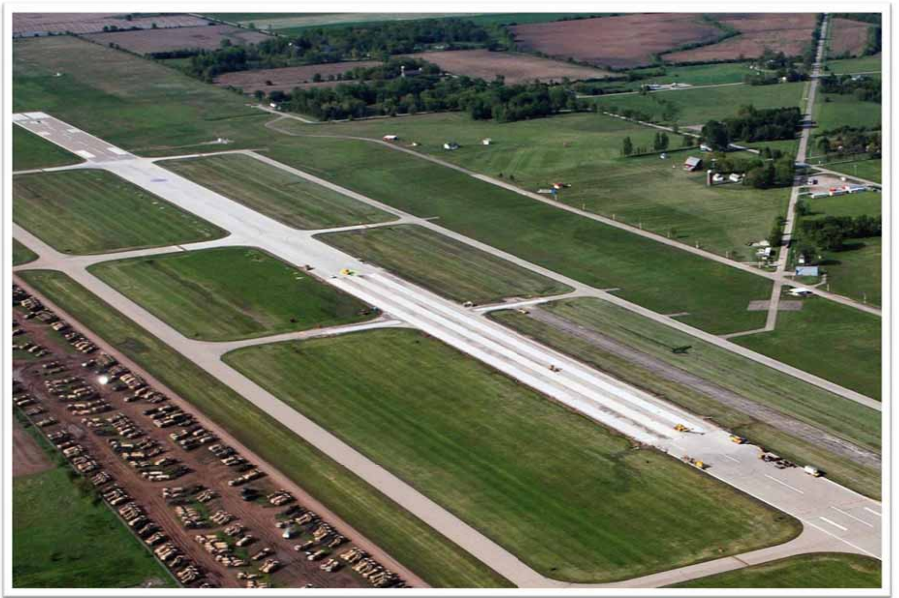
Phase 1: After – May 20, 2010