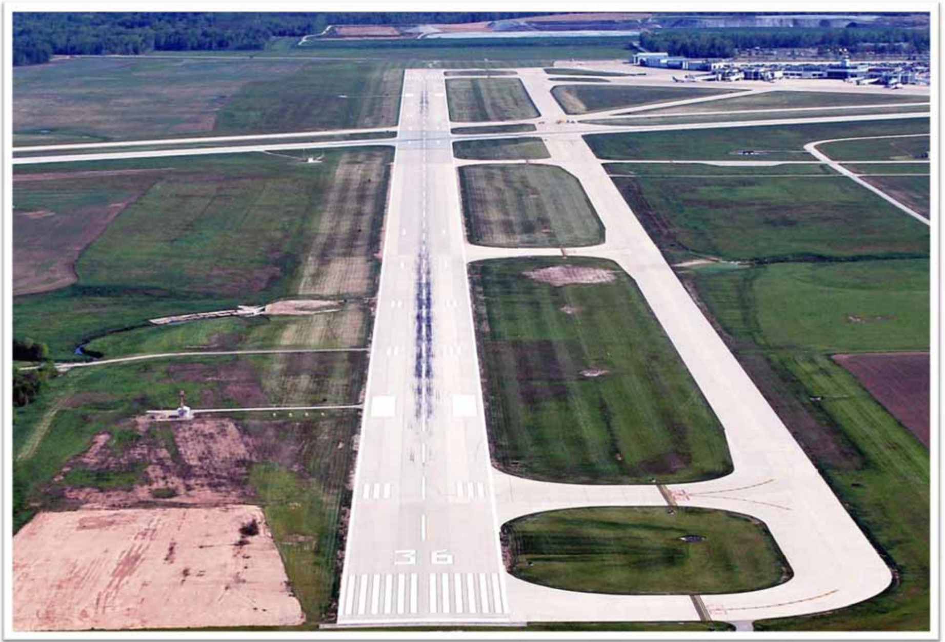
Austin Straubel International Airport May 20, 2010