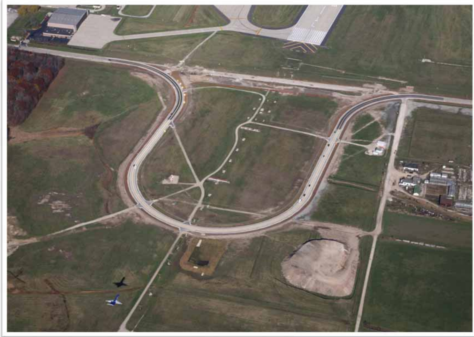
Phase 1: After - November 3, 2009