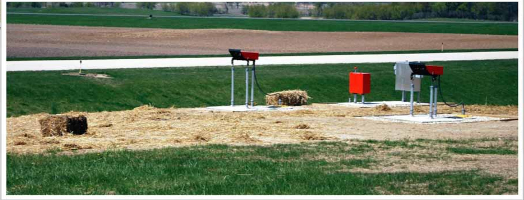
Dodge County April 22, 2010