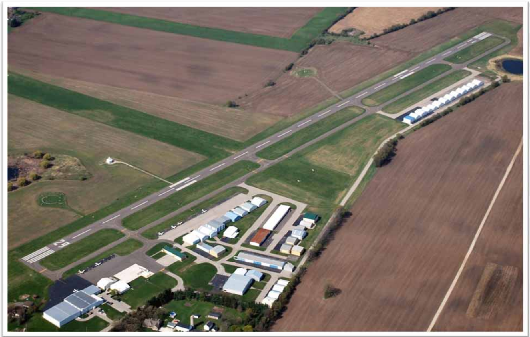
Burlington Municipal Airport April 22, 2010